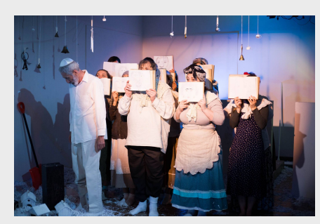
Tales of the Last Wednesday Based on stories by Isaac Bashevis