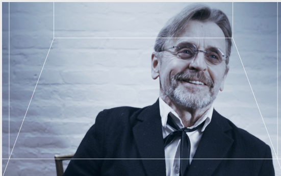
chekhovOS /an experimental game/

During the pandemic, while most theaters worldwide were shuttered, Arlekin Players Theatre wasted no time in transforming their small theater into the Zero Gravity (zero-G) Virtual Theater Lab, developing a new genre and producing two international virtual theater productions: State vs Natasha Banina and chekhovOS /an experimental game/ , which featured Obie winner Jessica Hecht as Ranevskaya and Mikhail Baryshnikov as Anton Chekhov.